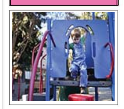
Playground time at the park!